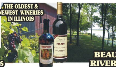
BEAUTIFUL RIVER DRIVE